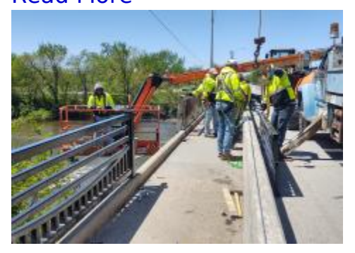
Tis the Season

As the daytime temperatures start to rise and days get longer, you will start to see more and more orange cones and construction signs show up across the City. Construction season is here and like all other years, the City of Beatrice Street Department has a busy season planned.