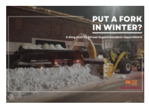
Put a Fork in Winter?

The City of Beatrice uses bi-monthly blogs to engage in transparency and connect with citizens. The heads of our City of Beatrice Departments write blogs in a rotation. Each Department Head writes a blog approximately twice per calendar year. You can find blog posts from across all Departments here.